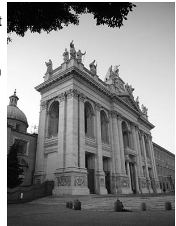
The Basilica of St. John Lateran in Rome

Today's liturgy reminds us that we are the Temple of God, the dwelling place for God in the Spirit. As such, our very lives, like the church building, must mirror God's beauty and majesty and holiness. We are challenged every time we celebrate the liturgy to become what we receive, the Body of Christ for the life of the world. May our celebration this day deepen our faith and strengthen our hope, so that the Spirit of God's love might shine forth in all we say and do.